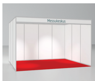
Profile structure (row stand)